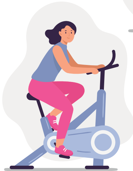
Fully equipped gymnasium